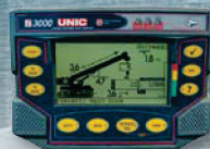
Safe load indicator