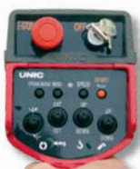
Standard radio remote control