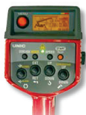
Optional radio remote control with digital feedback